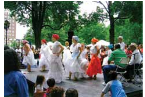
The Community Foundation was a founding funder and continues to support this world-class Festival today.

Stunning music and dance. Brilliant theater. Bright and emergent thinkers from around the globe.